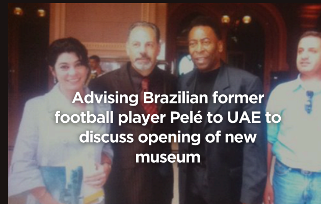
Advising Brazilian former football player Pelé to UAE to discuss opening of new museum