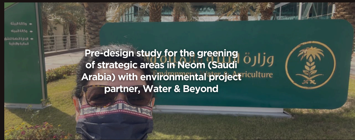
Pre-design study for the greening of strategic areas in Neom (Saudi Arabia) with environmental project partner, Water & Beyond