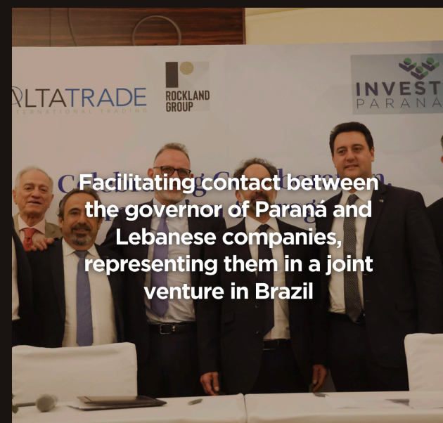
Facilitating contact between the governor of Paraná and Lebanese companies, representing them in a joint venture in Brazil