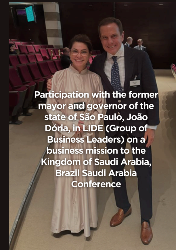
Participation with the former mayor and governor of the state of São Paulo, João Dória, in LIDE (Group of Business Leaders) on a business mission to the Kingdom of Saudi Arabia, Brazil Saudi Arabia Conference