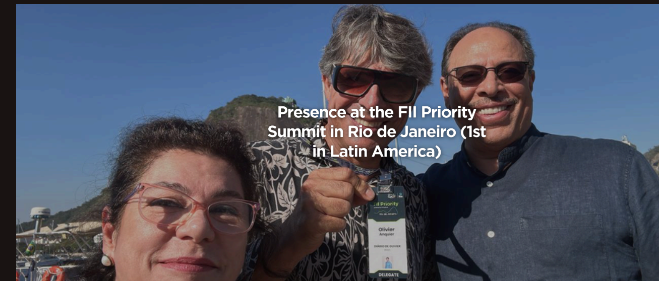
Presence at the FIL Priority Summit in Rio de Janeiro (1st in Latin America)