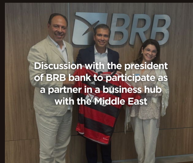
Discussion with the president of BRB bank to participate as a partner in a business hub with the Middle East