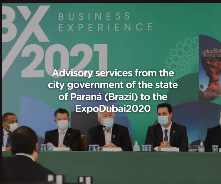
Advisory services from the city government of the state of Paraná (Brazil) to the ExpoDubai2020